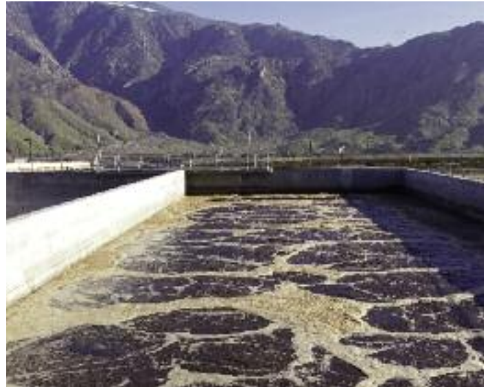
VARI-CANT® Jet Aeration System during the react phase of the OMNIFLO® SBR.