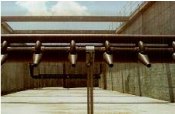
Oxidation ditch installation