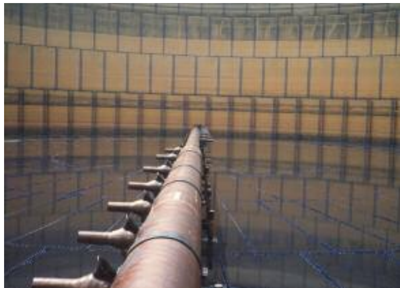
VARI-CANT® Jet Mixing System installed in circular basin.