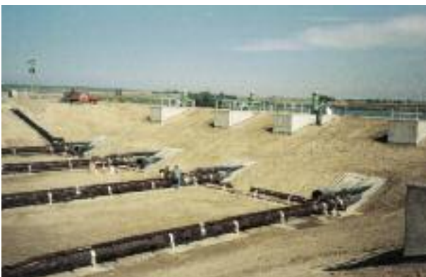
Earthen basin installation