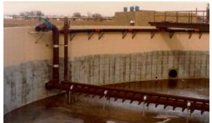
Pneumatic Backflush Cleaning System

The pneumatic backflush system requires turning the submersible pump off and leaving the blower on. After a minute the discharge valve on the riser is opened where the back flushed material exits. This is recommended for small systems, or systems utilizing submersible motive liquid pumps.