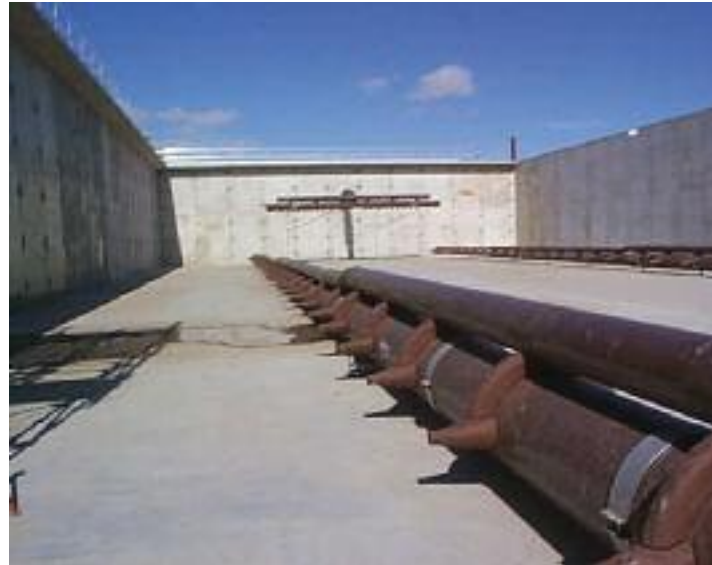
VARI-CANT® Jet Aeration System installed in OMNIFLO® SBR