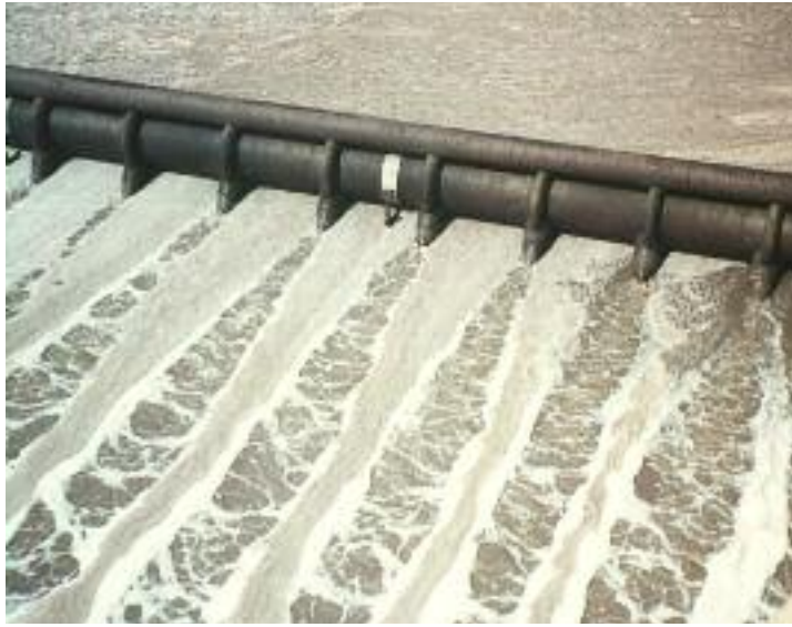
VARI-CANT® Jet Aeration System