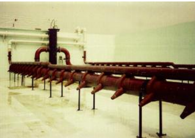
VARI-CANT® Jet Aeration System