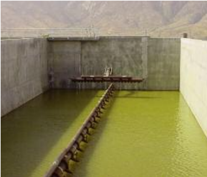
VARI-CANT® Jet Aeration System installed in OMNIFLO® SBR.