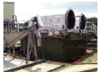
Cannibal® Solids Separation Module

From the settle period, the decant phase occurs when effluent is removed from just below the liquid surface by the Floating Solids Excluding Decanter from Siemens Water Technologies. In the last step or Idle/Waste Sludge period, the reactor waits to receive flow. Settled sludge is drawn through the influent distribution manifold and removed from the SBR reactor. It is during this step that the interchange activated sludge (IAS) is returned to the SBR tanks with sludge periodically purged from the system.