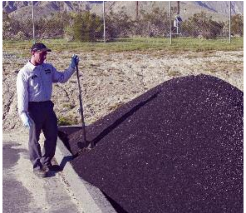
Biological solids purged from facility