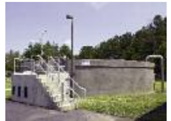
Cannibal® Side-Stream Interchange Bioreactor