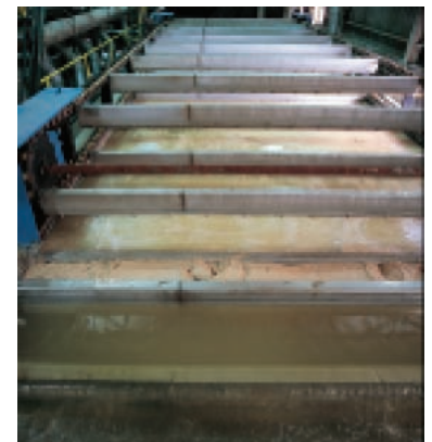
The clear effluent, separated float and influent flow can be seen from the head end of a Folded Flow® DAF separator.