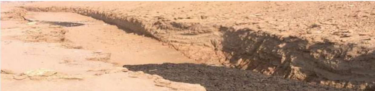
LANDFILL SITE TRENCH BEING FILLED WITH SLUDGE NEAR JEDDAH