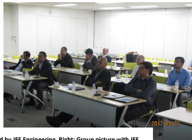
Left: The team attending a technical presentation delivered by JFE Engineering, Right: Group picture with JFE management.