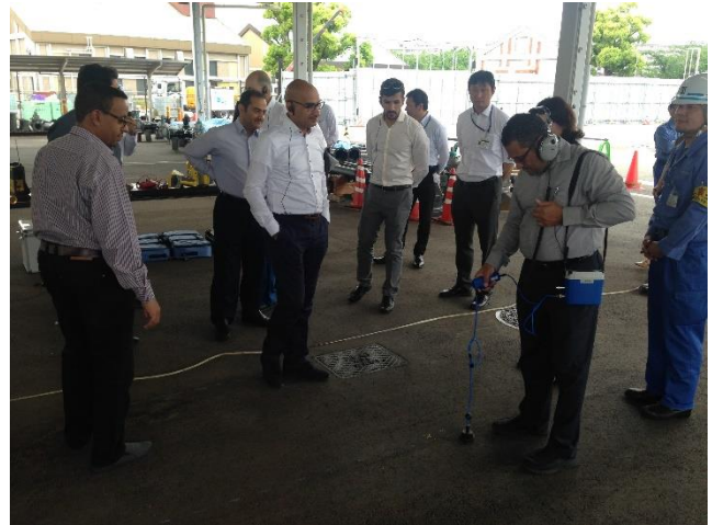
The mission team “hands-on” training on leak detection devices and leak control methodology