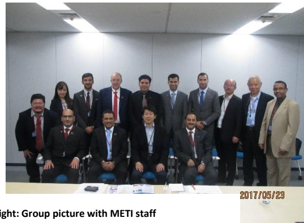
Left: SAWEA team meeting METI Director. Right: Group picture with METI staff