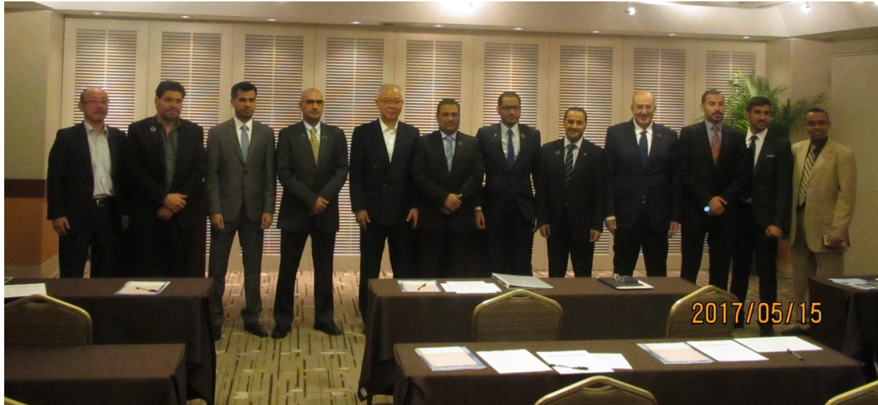
Group Photo: Mission Opening Ceremony Hosted by JCCME

To conclude, this mission to Japan provided the SAWEA members with valuable knowledge about water treatment and utilization of treated water, and Japan's efforts for effective utilization of sludge. It also helps Japanese companies to gain more understanding of the Kingdom needs for water sector. This hopefully will increase the collaboration between Japan and Saudi Arabia to develop water industry and protecting environment.