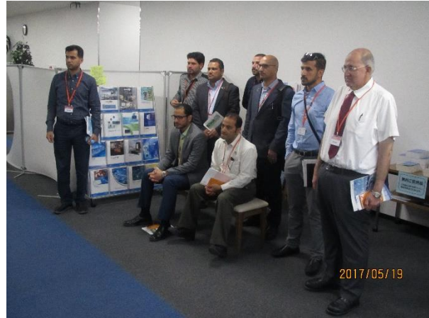
Left: The team is listening to a presentation about Yokogawa plant management and control systems. Right: The team is visited the SACAD Training Center