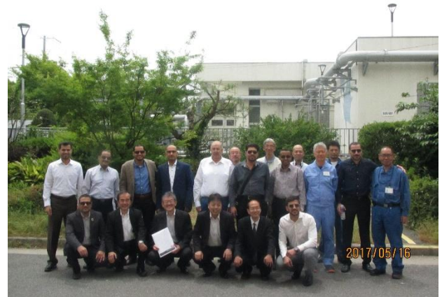
Team Group Picture