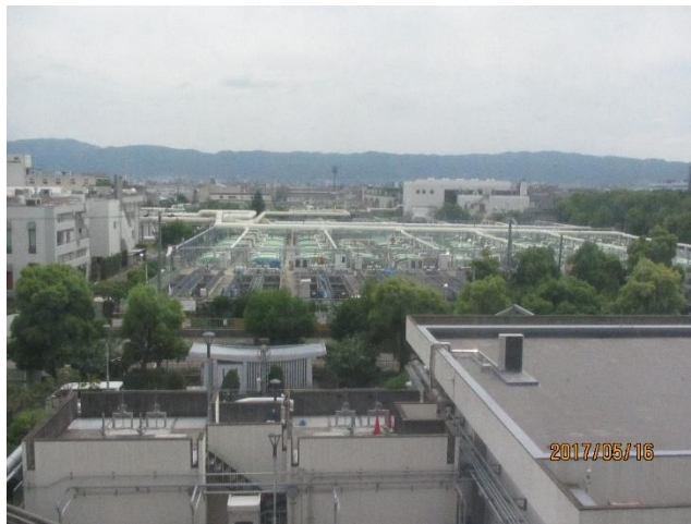
Hirano Wastewater Treatment Plant

During the visit, the team listened to a brief presentation followed by a visit to the plant which is producing a total of 8558 tons of carbonized fuel per year. The ultimate product of the plant (carbonized fuel) is transported and sold to power plant for electricity generation and to municipality as well for asphalt production.